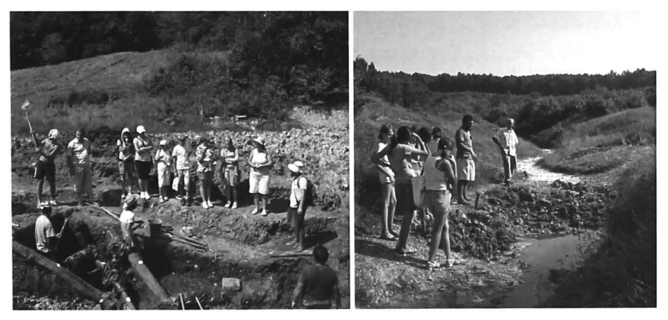
Fig.1. Visiting the Băile Figa archaeological diggings, 2010(left); Fig.2. - Visiting the Băile Figa archaeological site (right)

In the beginning all the participants visited the Băile Figa archaeological site where they could observe the archaeologists at work and they got precious information regarding modern archaeological research methods. The students had the opportunity to observe the 3000 year old findings in situ – the wooden instalments used by prehistoric people to exploit rock salt and brine.