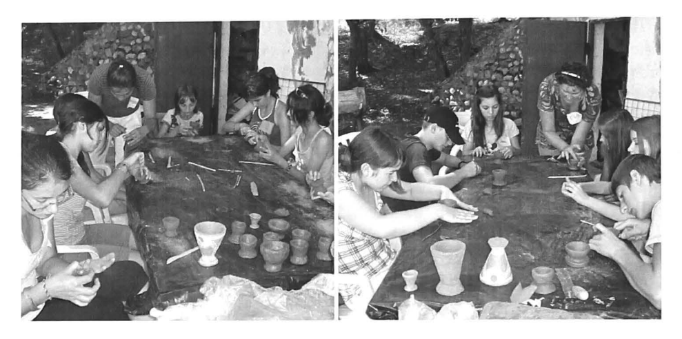
Fig.3 and 4. Manual modelling of the clay briquetages

One of the most captivating activities was the experiment of firing the briquetages in the oven-pit and in the unicellular surface oven. Through firing at high temperatures (the oven-pit firing reached an 800° C temperature) the clay vessels became ceramic vessels, a part of them being used afterwards for another experiment – in obtaining solid salt by boiling brine in briquetage .