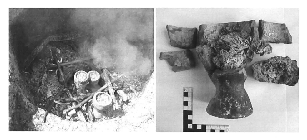
Fig.5. Firing the briquetages in the oven-pit (left); Fig.6. Briquetages (detail)(right).

One of the most captivating activities was the experiment of firing the briquetages in the oven-pit and in the unicellular surface oven. Through firing at high temperatures (the oven-pit firing reached an 800° C temperature) the clay vessels became ceramic vessels, a part of them being used afterwards for another experiment – in obtaining solid salt by boiling brine in briquetage .